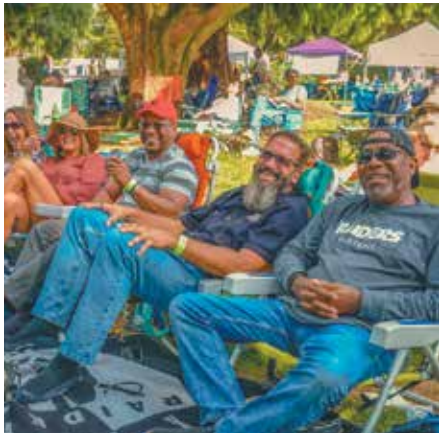
Vancouver Wine & Jazz Festival