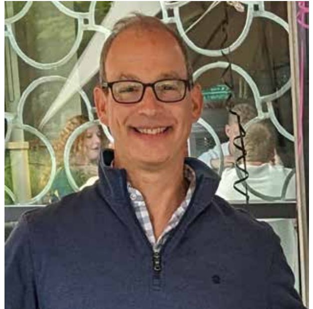
Neil Halpern photo courtesy of himself

Jazz is an evolving art form, so I'm excited to see where Earshot goes with it in the coming years and thankful to be a part of its growing future.