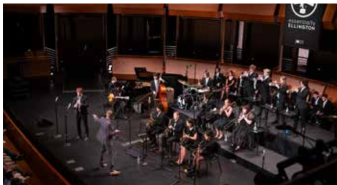
Garfield High School