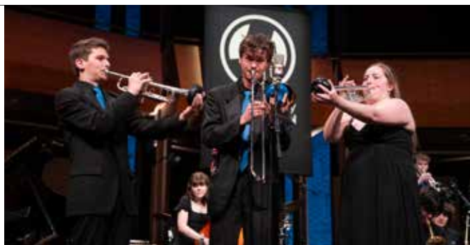
Bothell High School