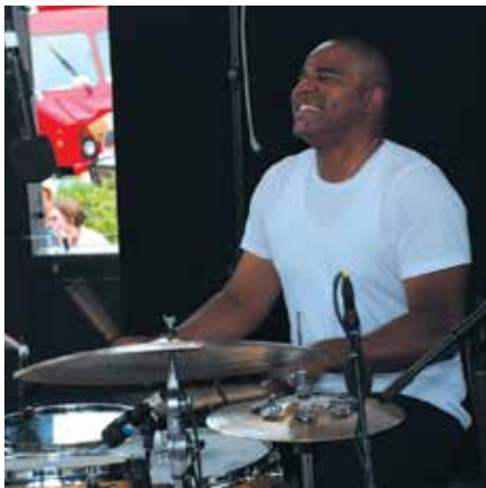
Ellensburg Music Festival