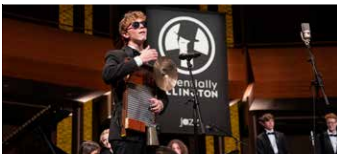
Roosevelt High School