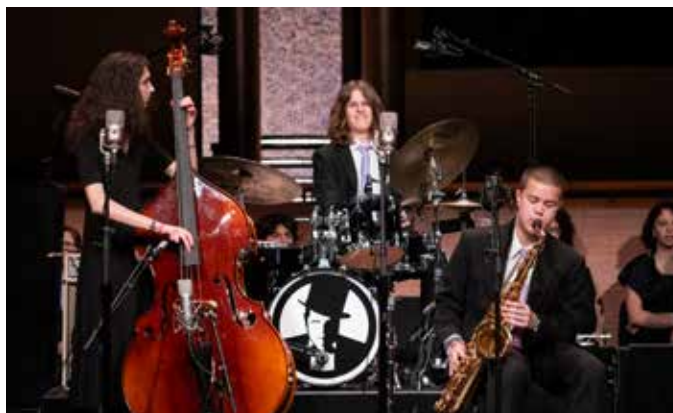
Garfield High School