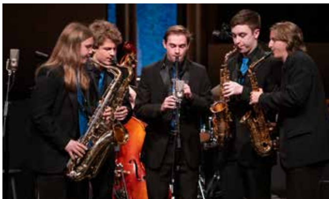
Bothell High School