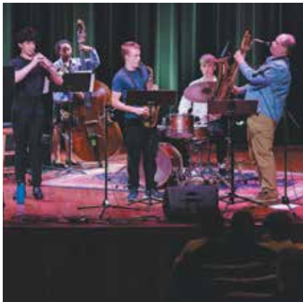
Jazz Port Townsend