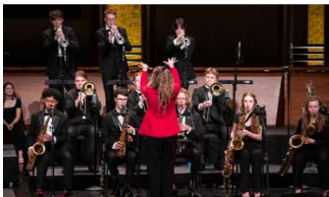
Roosevelt High School